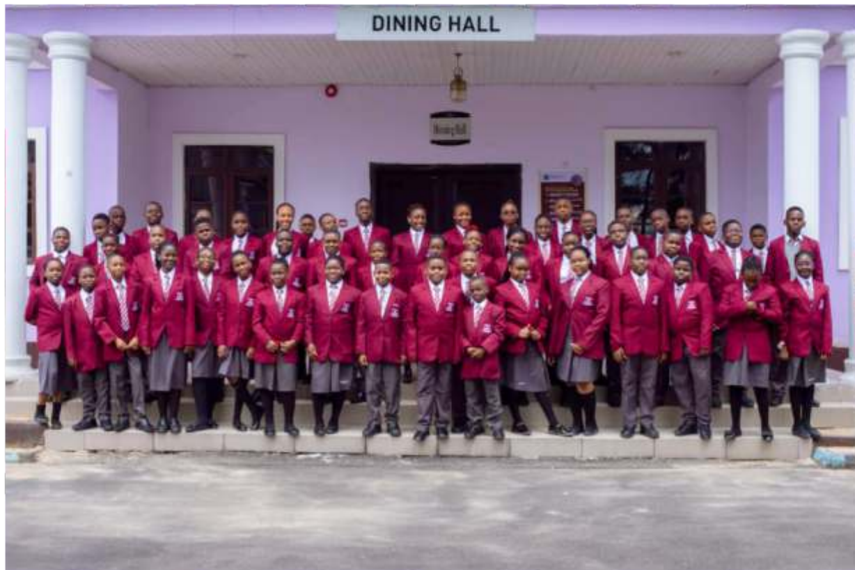
2020/2021 Academic Session