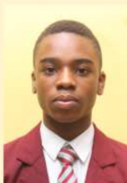
Accra-Jaja PAWARI V.